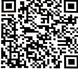
Table Tennis Competition -

All students are hereby informed that a Table Tennis and Chess competition is going to be organised on 10 th August 2024. All interested students can register through the given link/QR code-